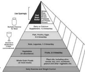
Healthy Eating Pyramid

http://www.hsph.harvard.edu/nutritionsource/pyramids.html