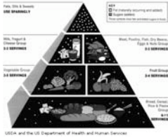
The USDA Food Pyramid

http://www.hsph.harvard.edu/nutritionsource/pyramids.html